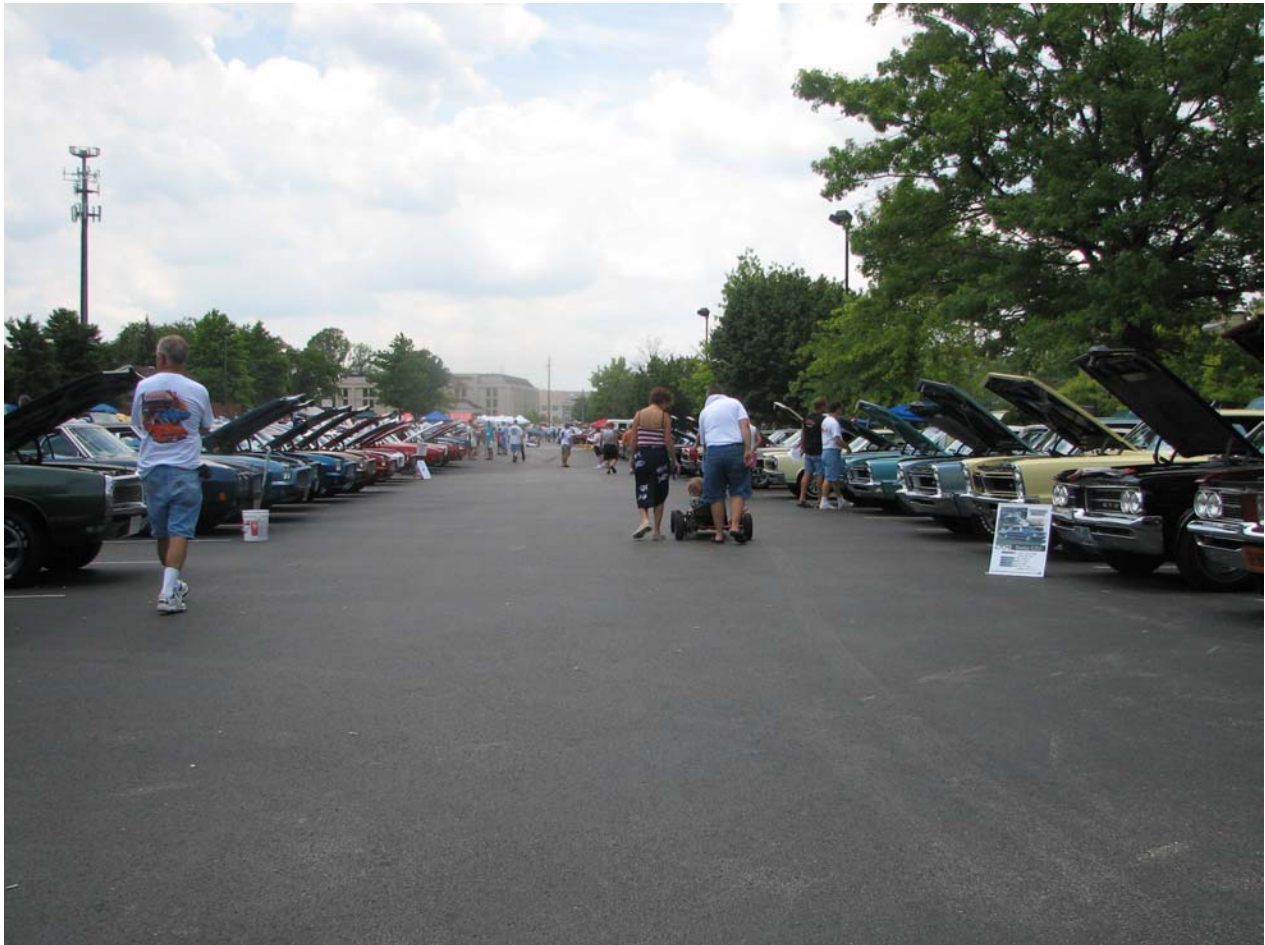
GTOAA Louisville KY