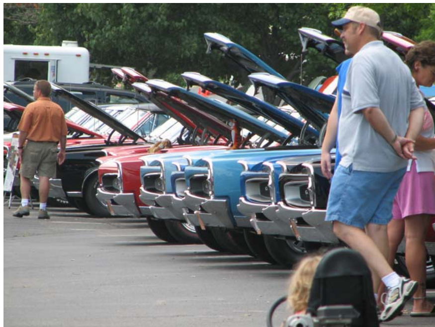
GTOAA Nationals Louisville KY