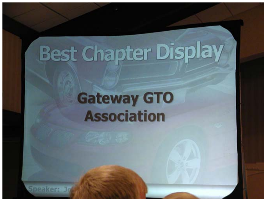
Presented To Gateway GTO at the GTOAA Nationals