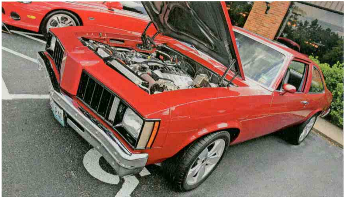
Talk about blending the best of new and old: Vic and Joyce Nettles 78 Phoenix features the drivetrain, rear suspension, and wheels and tires of a late-model GTO. Nicely done and very unique.