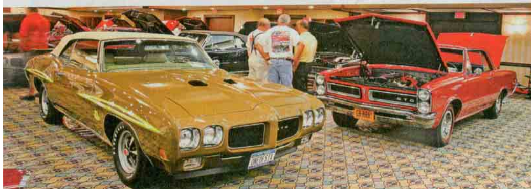
.... Read the hoodscope and the license plate on Ray DeCrescenzos Concours-Gold 70 Judge convertible and you'll get the picture.