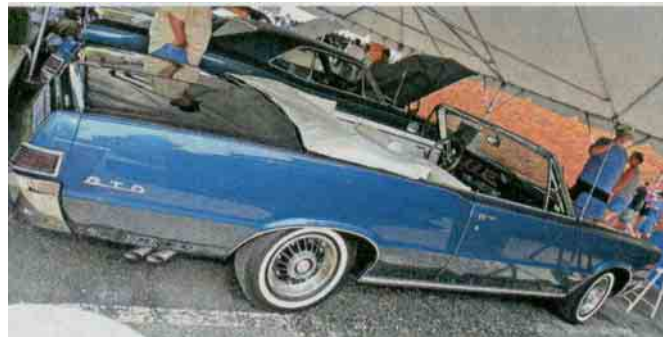
For '66, 8-Lug wheels were to be offered as an option on GTOs, then the option was cancelled. That didn't stop Bill and Kathy Kraeling, who wanted them for their '65. They look like they grew there, don't they?